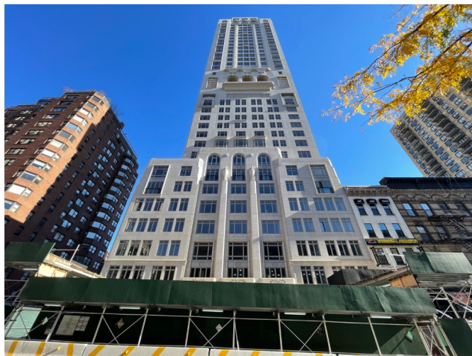
200 East 83rd Street.

Additional windows and limestone façade panels have been installed since our last update in July, including on the eastern elevation, where the construction elevator is being dismantled. Only a few finishing touches remain, such as the installation of windows near the top of the tower and at its midpoint. Sidewalk scaffolding still surrounds the property, but should be removed in the coming weeks as exterior work wraps up.