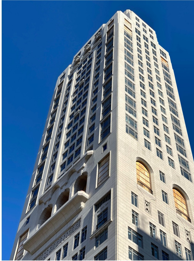
200 East 83rd Street.