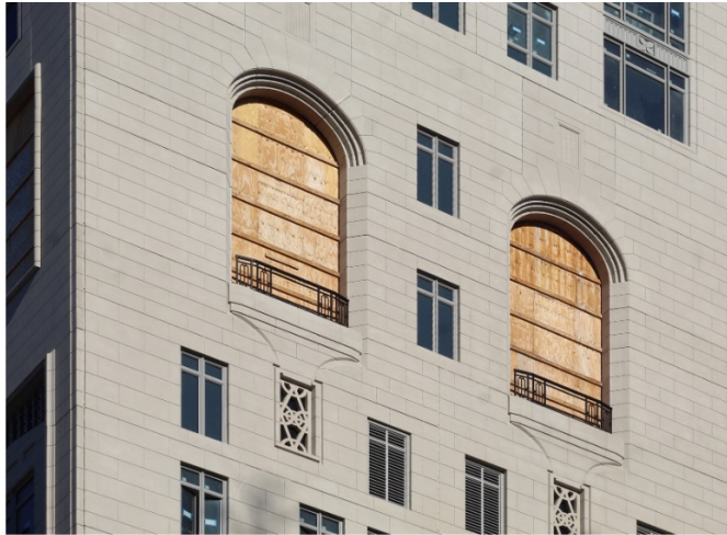
200 East 83rd Street.