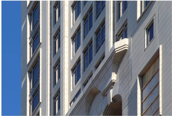
200 East 83rd Street.