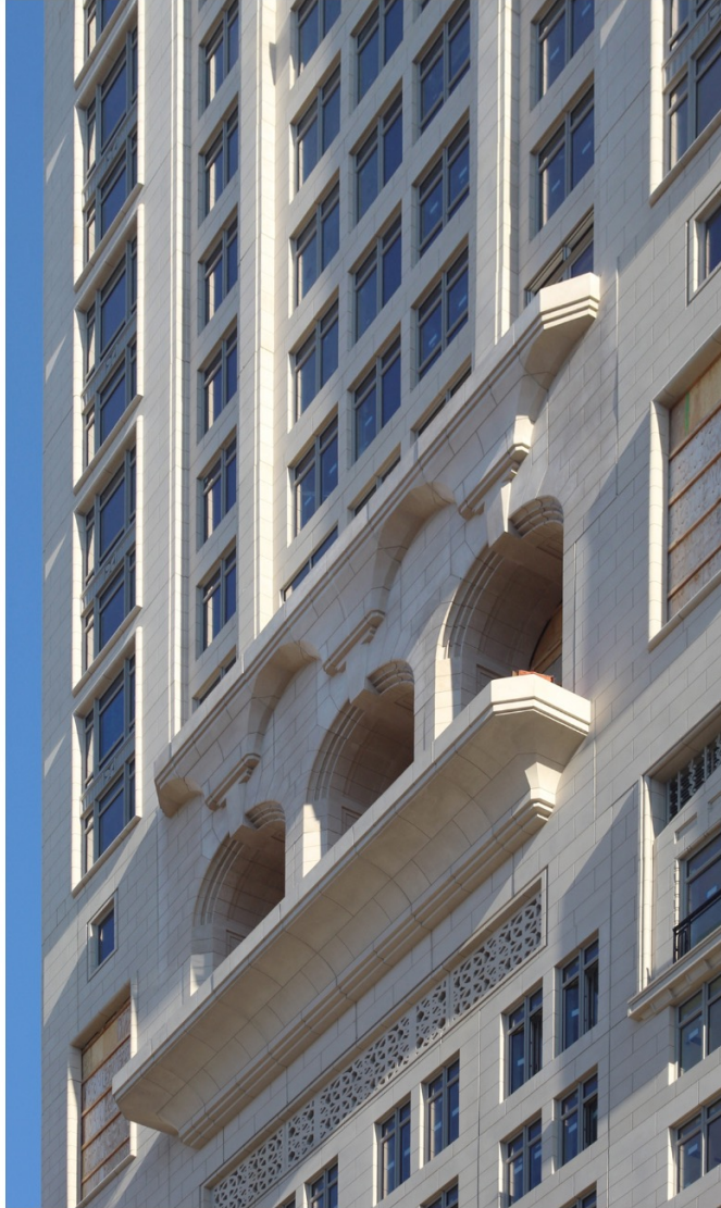
200 East 83rd Street.