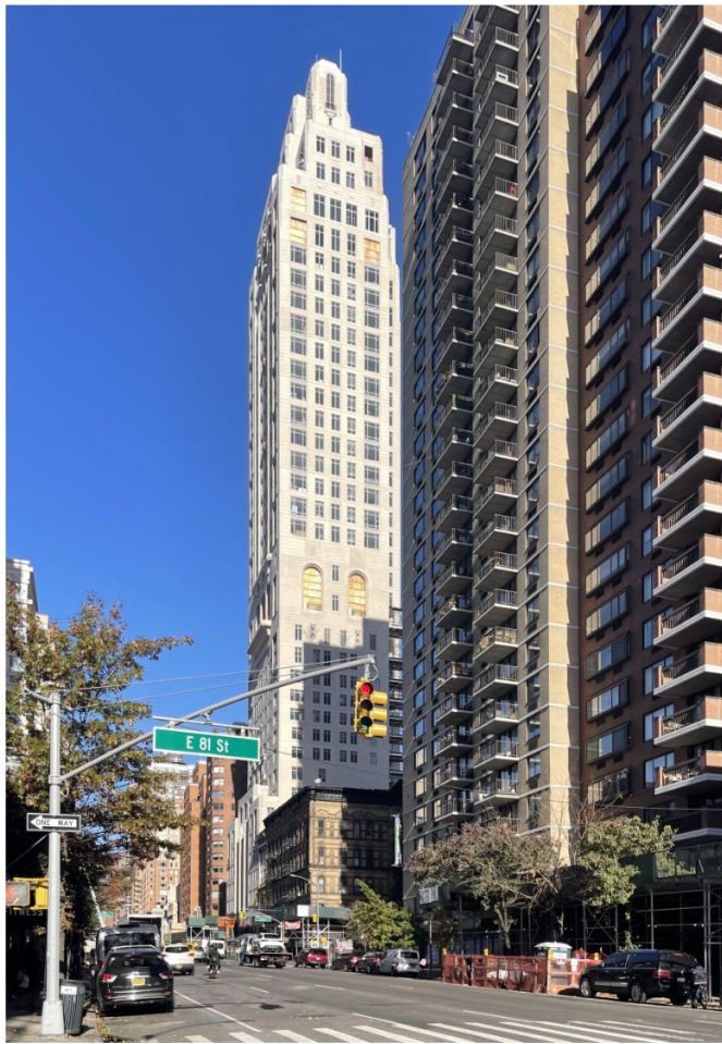
200 East 83rd Street.