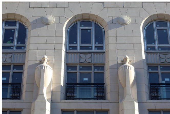
200 East 83rd Street.