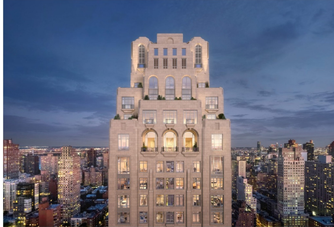
200 East 83rd Street. Rendering by DBOX.

BY: MICHAEL YOUNG AND MATT PRUZNICK 8:00 AM ON DECEMBER 4, 2022