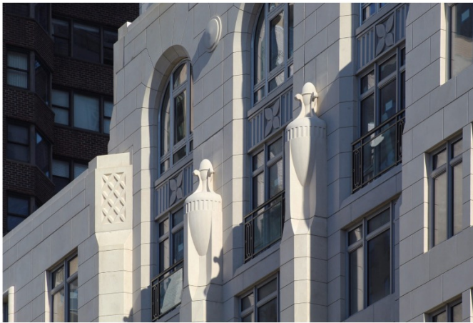
200 East 83rd Street.