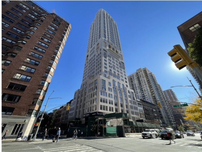
200 East 83rd Street.

Homes will come in one- to six-bedroom layouts and with pricing from $2.05 million to $32.5 million. Two-bedrooms begin at $3.175 million, three-bedrooms at $4.35 million, and four-bedrooms at $5.35 million. There are also three penthouses available in five- or six-bedroom layouts with prices from $23 million to $32.5 million. Each comes with private outdoor space.