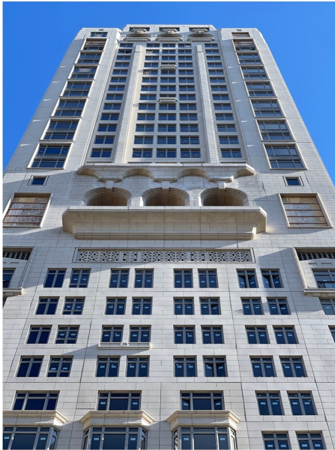
200 East 83rd Street.