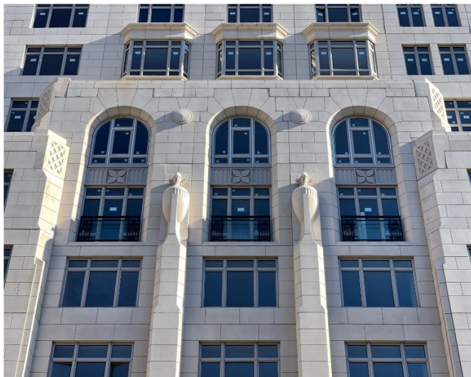
200 East 83rd Street.