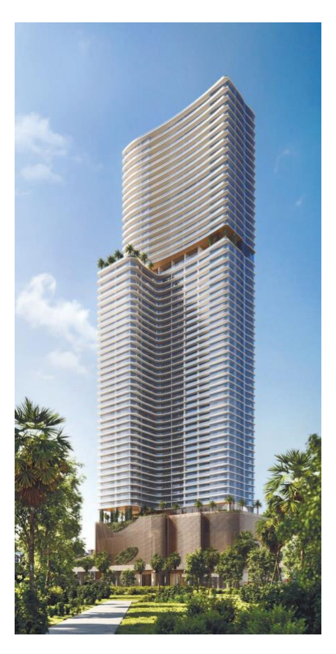
JEM Private Residences tower exterior