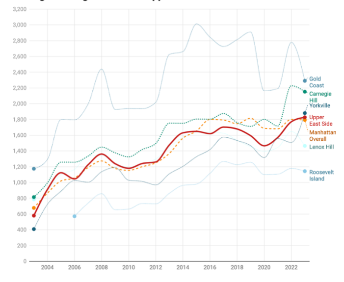
Number of condos sold on the Upper East Side per year since 2004