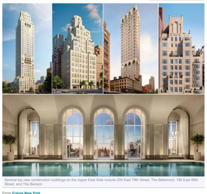
Top 10 Upper East Side Condos: Wealthy buyers covet traditional design

During the Gilded Age (defined as the 1870s to the late 1890s), the opulent mansions lining Upper East Side streets were considered the center of New York society. More than 100 years later, Emmy Award-winning HBO drama The Gilded Age was recently picked up for a third season, some have speculated that a new Gilded Age is taking place off-screen, and the Upper East Side is clearly top of mind for luxury buyers: Last week, both Manhattan's highest-priced sale and top luxury contract took place in traditional Upper East Side buildings located at the center of a condo boomlet.