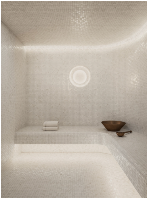
The steam room.

“We aimed to balance the duality of traditional uptown living with modern New York sensibilities,” George Yabu says. “Drawing from the Classical and Victorian architectural styles that give the Upper East Side its timeless elegance and rhythm, we designed every detail—from the crown molding and arches to the patterned stone floors—to honor the neighborhood’s heritage. With the oak leaf motif repeating along the building’s exterior, we thought it would be fun to bring that element inside in a more whimsical way, inspiring a playful mosaic pattern for the pool and subtle touches of the motif on the entry door pulls.”