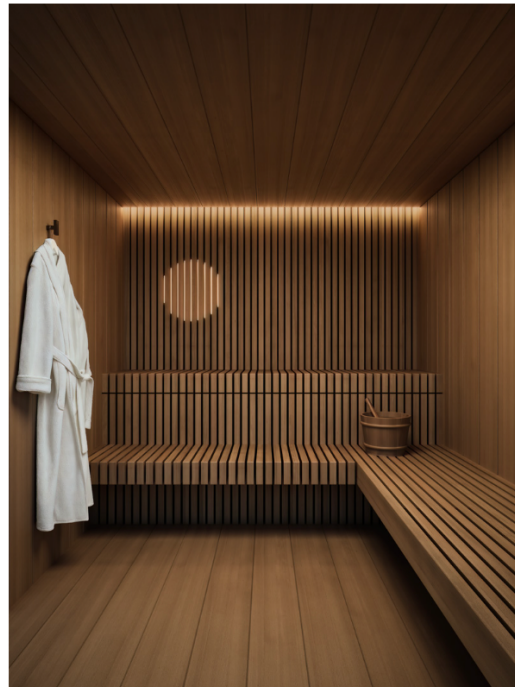
The sauna.

Amenities include a striking 75-foot-long pool with double-height barrel ceilings and massive arched windows; 24-hour concierge-attended lobby; Winter Garden; state-of-the-art fitness and yoga facilities; treatment room; movie theater; recording studio for music practice, recording, or podcasting; a golf simulator; children’s playroom with custom mural art; and a porte-cochère.