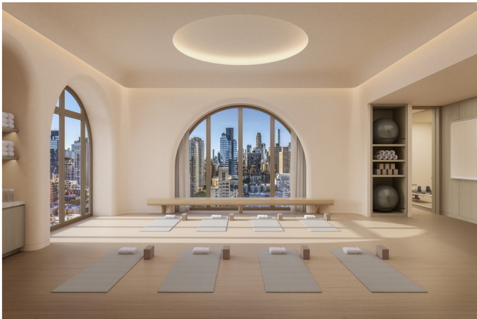
A yoga center.