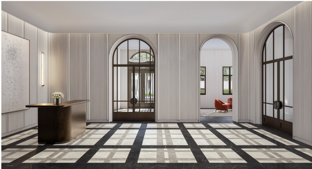
Residents have access to a 24-hour concierge-attended lobby.