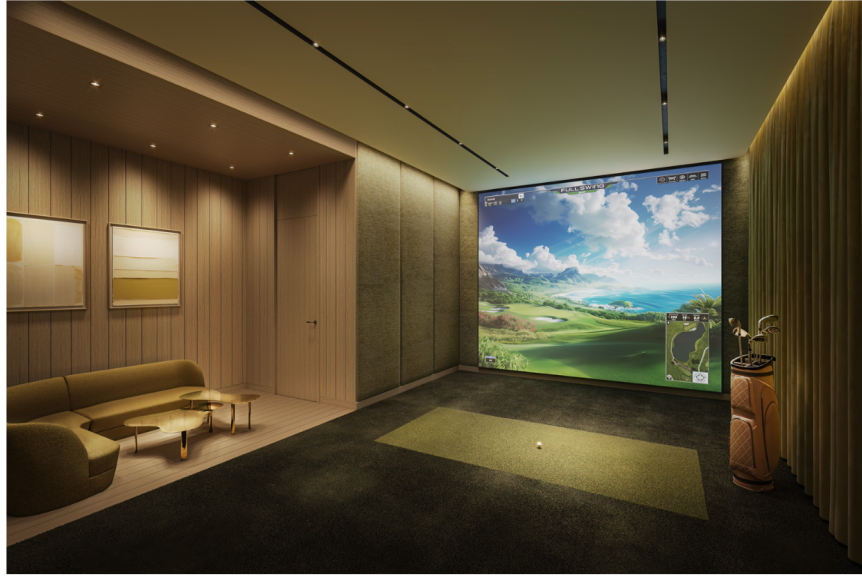
A multi-sports simulator.