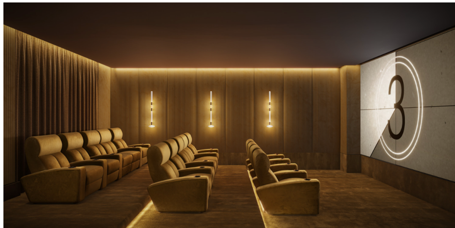
A private cinema.

https://galeriemagazine.com/yabu-pushelberg-upper-east-side/