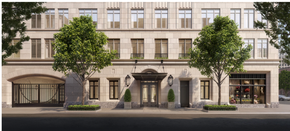
The facade is embossed with sculpted details and carved wildflowers.

"Our design for 255 East 77th Street is rooted in the idea of bridging generations—creating a balanced space that resonates with both the younger generation returning to the Upper East Side and their families who have long resided there," Glenn Pushelberg tells Galerie . "By distilling Classical architectural elements through a contemporary lens, we crafted an environment that feels both sophisticated and approachable."