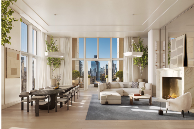
The residences feature floor-to-ceiling windows.

Classical architecture is knit into the fabric of the Upper East Side, which will include 255 East 77th. The facade is embossed with sculpted details and carved wildflowers, custom antique bronze double entry doors, custom stone parapets, and decorative details, including the building's signature oak leaf motif. The building honors the neighborhood's legacy, while representing a new generation of Upper East Side living with hotel-like amenities, smart home technology, and functional layouts that adhere to the needs of today's younger buyers.