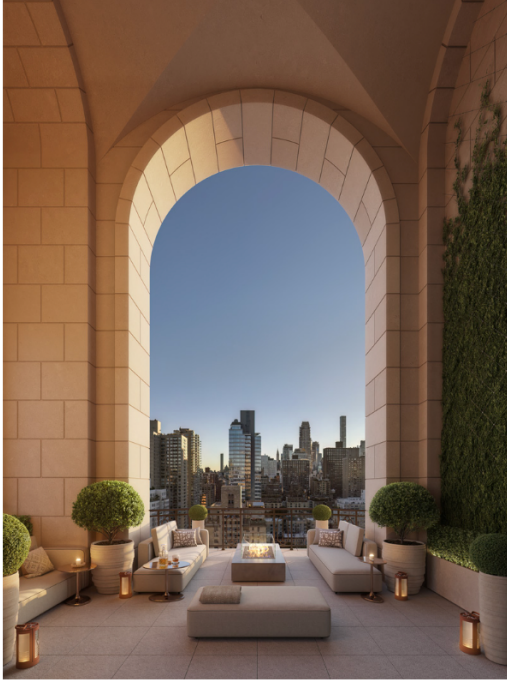
The building features a porte-cochère. PHOTO: DBOX