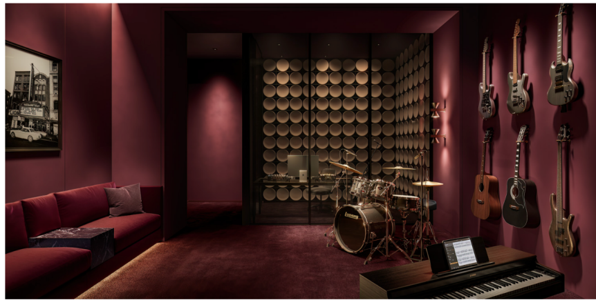
A recording studio.