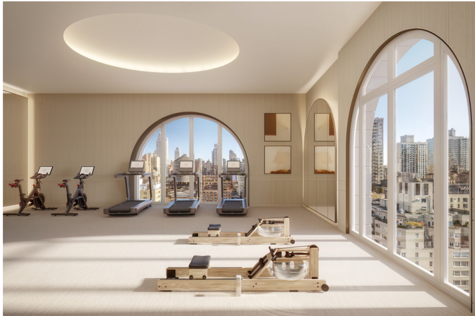
A state-of-the-art fitness center.