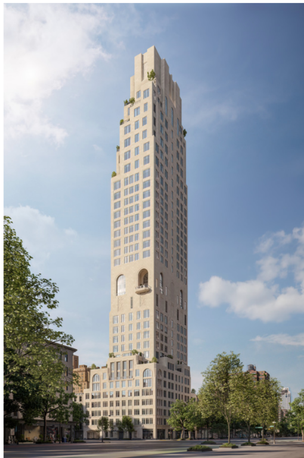
255 East 77th, a 62-unit luxury condo tower.