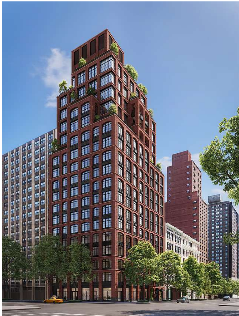
The Willow, located at 201 East 23rd Street, rises 19 stories and features a stunning exterior by COOKFOX Architects, with a hand-laid masonry façade composed of a custom red brick blend, cast stone, and sleek black metal accents.