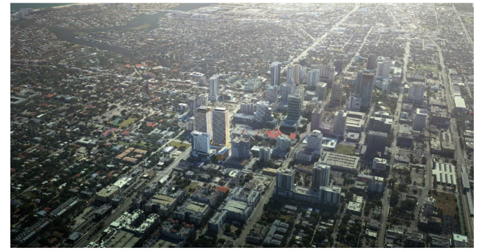
201 North Federal Highway.