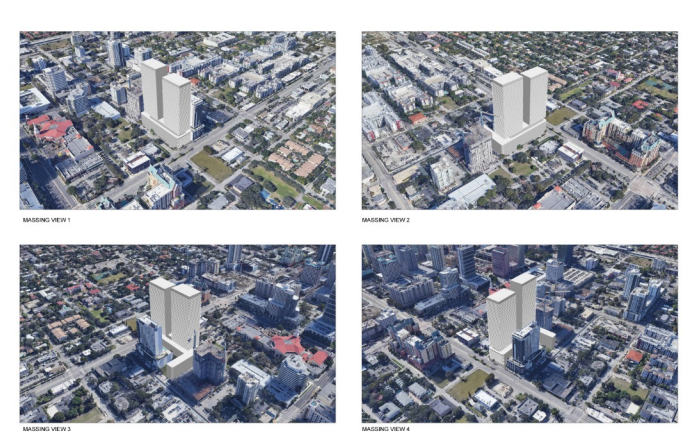
201 North Federal Highway.