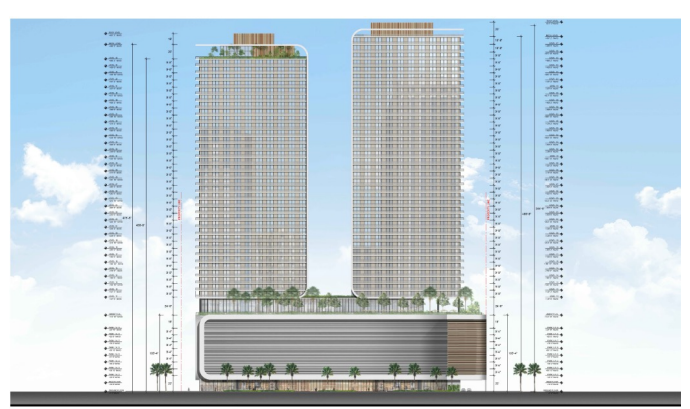
201 North Federal Highway.