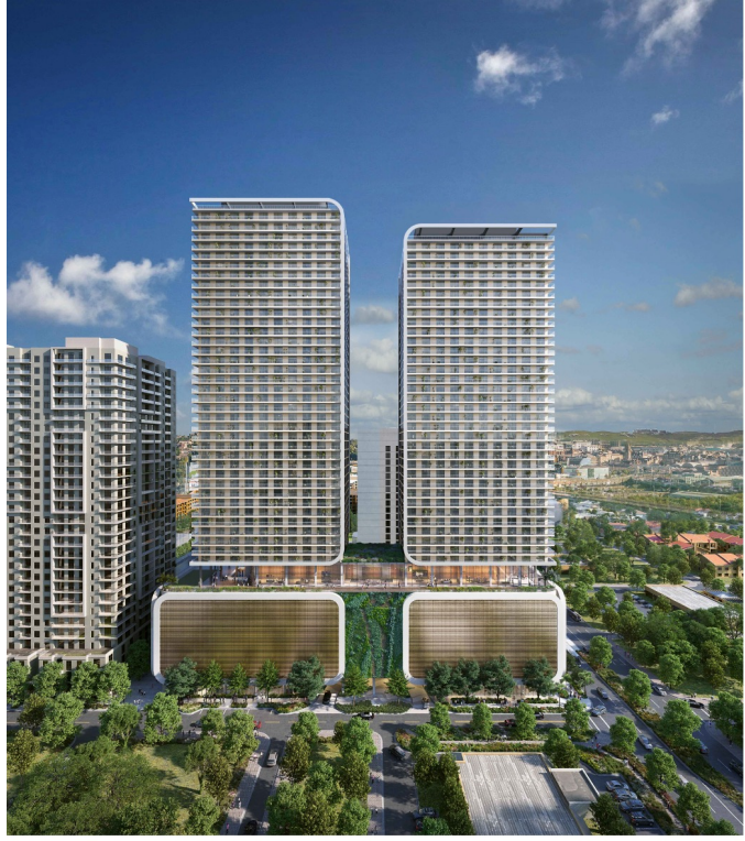
201 North Federal Highway.

The design of the towers is defined by a bold curvilinear frame that runs from the base to the rooftop, adding visual interest and elegance. These frames are positioned outwardly, away from the center of the building, to create a mirrored effect that is both striking and unique. The continuity of the frames in the towers and the podium below creates a cohesive aesthetic throughout the project and emphasizes its verticality. At night, the illuminated frames come to life, evoking the City's downtown skyline and further enhancing the building's presence in the urban landscape.