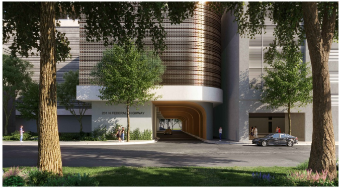
201 North Federal Highway.