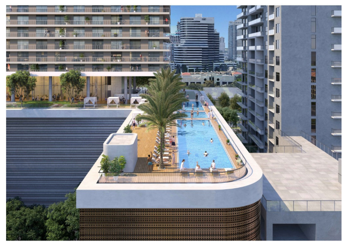
201 North Federal Highway.

Both buildings showcase wrap-around terraces that extend around the entire building and large windows on each residential level, providing residents with panoramic views and adding visual interest to the building's façade. The podium is clad in perforated metal screening and a green wall that separates the two towers, creating an inviting and visually appealing space.