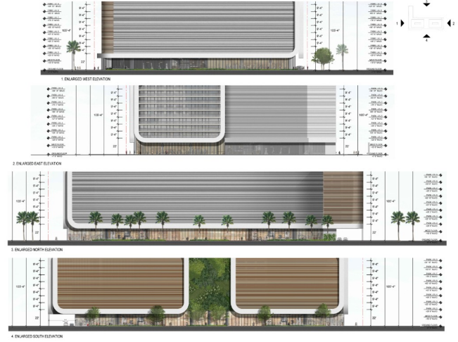
201 North Federal Highway.