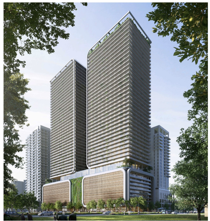
201 North Federal Highway. Credit: Naftali Group