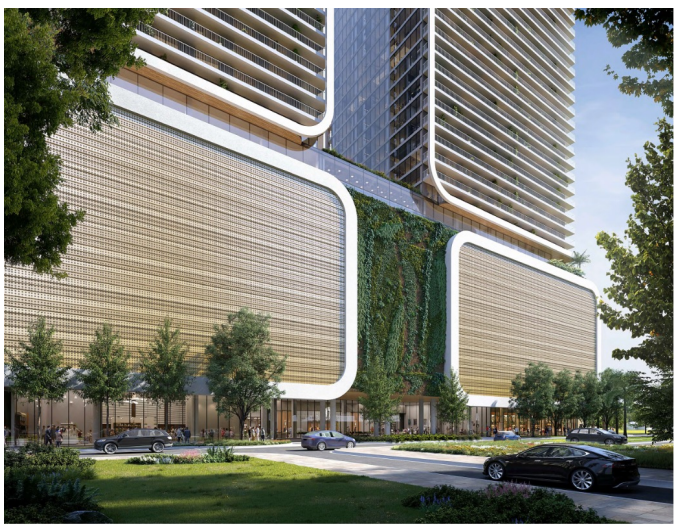
201 North Federal Highway.

The design of the towers is defined by a bold curvilinear frame that runs from the base to the rooftop, adding visual interest and elegance. These frames are positioned outwardly, away from the center of the building, to create a mirrored effect that is both striking and unique. The continuity of the frames in the towers and the podium below creates a cohesive aesthetic throughout the project and emphasizes its verticality. At night, the illuminated frames come to life, evoking the City's downtown skyline and further enhancing the building's presence in the urban landscape.