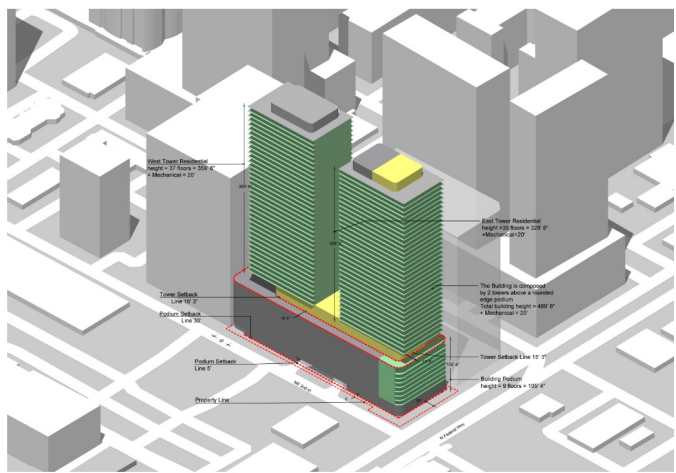
201 North Federal Highway.