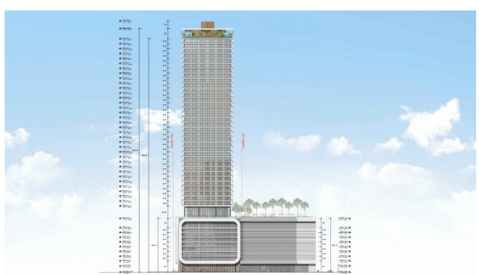
201 North Federal Highway.