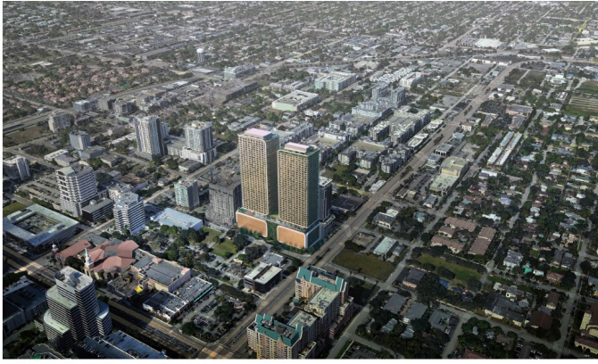
201 North Federal Highway.

Both buildings showcase wrap-around terraces that extend around the entire building and large windows on each residential level, providing residents with panoramic views and adding visual interest to the building's façade. The podium is clad in perforated metal screening and a green wall that separates the two towers, creating an inviting and visually appealing space.