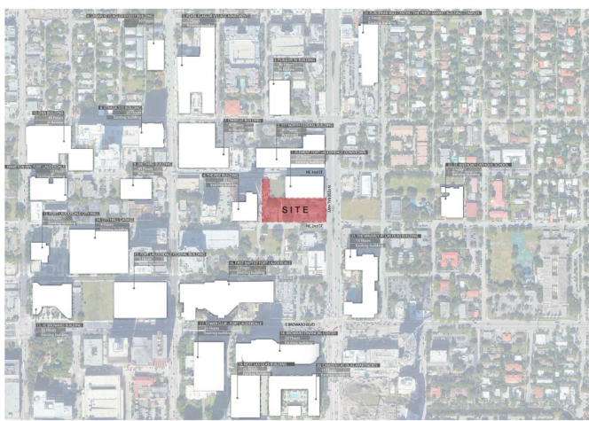
201 North Federal Highway.