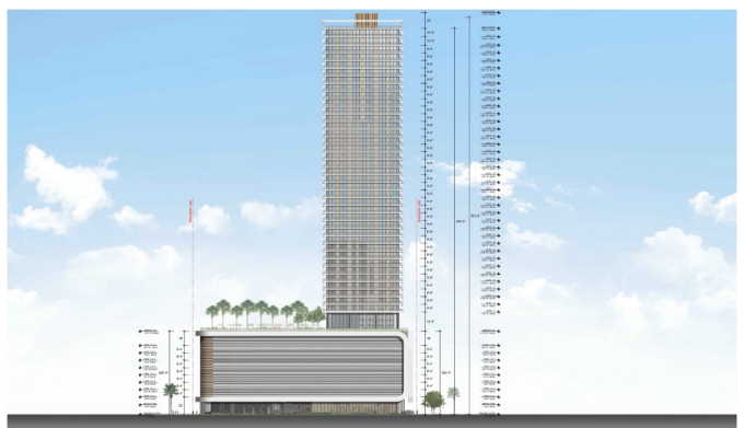
201 North Federal Highway.