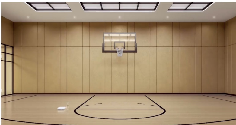
The basketball court for The Henry Residences. Designed by Robert A. M. Stern Architects.

A roof terrace atop the low-rise podium will be lined with planters and furnished with outdoor seating, a fire pit, a grilling station next to an al fresco dining setup.