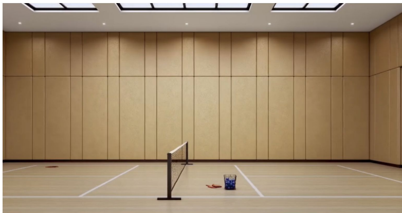
The pickle ball court for The Henry Residences. Designed by Robert A. M. Stern Architects.