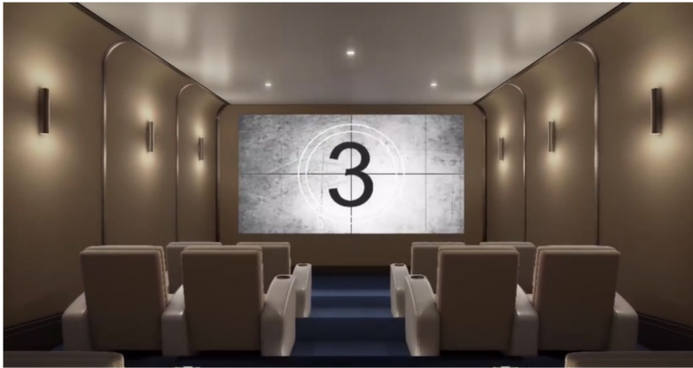
The cinema room for The Henry Residences. Designed by Robert A. M. Stern Architects.