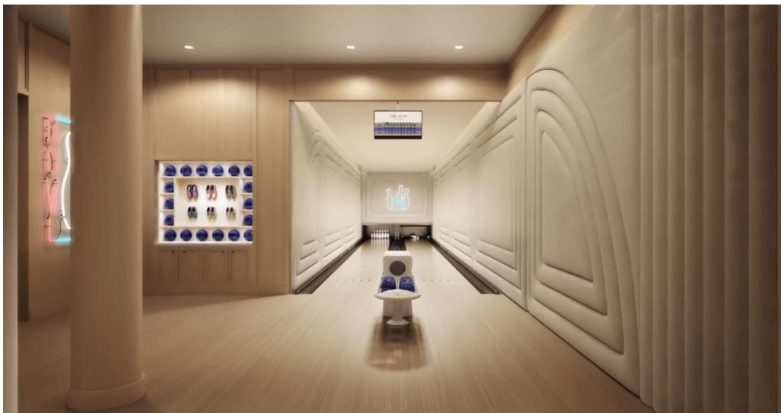
The bowling alley for The Henry Residences. Designed by Robert A. M. Stern Architects.