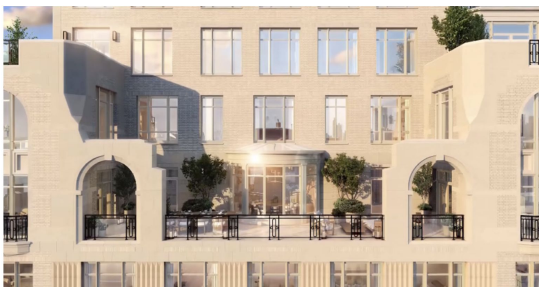
The Henry Residences. Designed by Robert A. M. Stern Architects.

The first two renderings focus on the upper stories of the tower, which will rise on the western end of the parcel. These top levels feature a nearly symmetrical massing with terraces and balconies lined with glass and metal railings and populated with trees and shrubbery. The fenestration is composed of floor-to-ceiling windows with some arched openings, and the bulkhead has chamfered corners and a doorway leading to the landscaped roof deck.