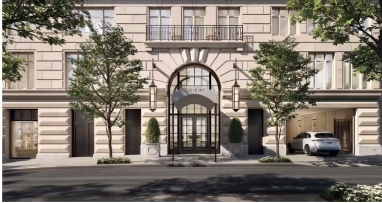
The main entrance for The Henry Residences. Designed by Robert A. M. Stern Architects.

The main entrance will be located at the center of the southern elevation along West 84th Street, and is shown flanked by two large light fixtures and topped with a curved sidewalk canopy within the outline of the double-height arched window. A garage entrance will sit directly to the right of the entrance. The ground-floor façade features thick cornices and stone blocks carved with angled surfaces to accentuate the contrast of sunlight and shadow.