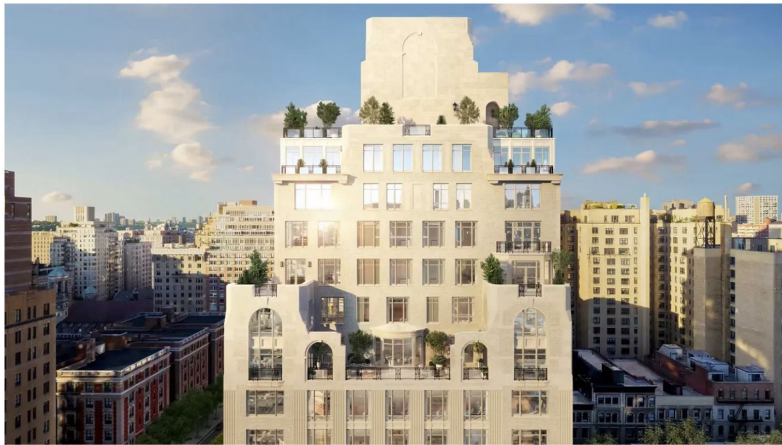
The Henry Residences. Designed by Robert A. M. Stern Architects.