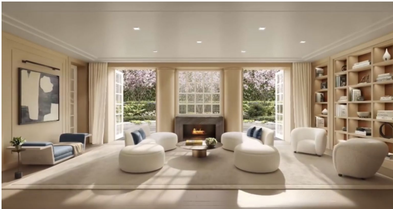
The residential lounge and outdoor garden for The Henry Residences. Designed by Robert A. M. Stern Architects.

A list of residential amenities has yet to be disclosed, though the following images depict an indoor lounge with a fireplace connecting to a private outdoor garden, a two-lane bowling alley, an indoor basketball court, a cinema, and an indoor pickle ball court illuminated by skylights.