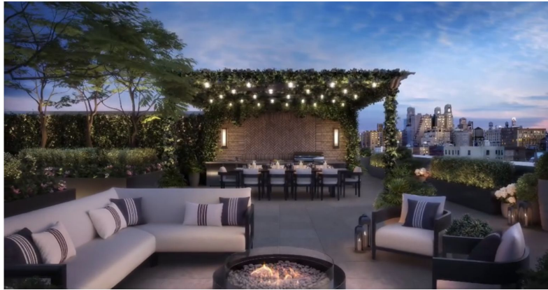
The podium rooftop terrace for The Henry Residences. Designed by Robert A. M. Stern Architects.

The black and white diagram below is posted on the construction board and shows both the main tower and the conjoining podium annex taking up the remaining eastern half of the land.