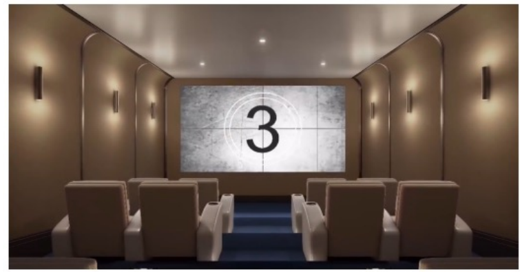
The cinema room for The Henry Residences. Designed by Robert A. M. Stern Architects