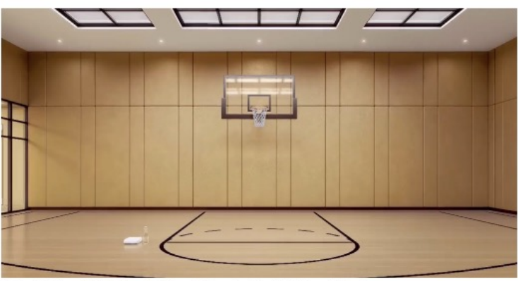
The basketball court for The Henry Residences. Designed by Robert A. M. Stern Architects.