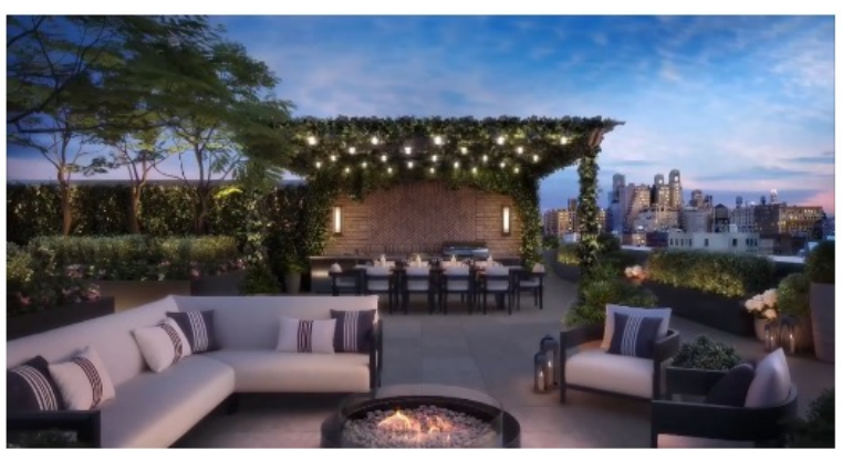
The nodium roofton terrace for The Henry Residences: Designed by Robert A. M. Stern Architects

The site is located two blocks south of the 86th Street subway station, served by the local 1 train.