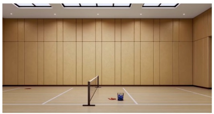
The pickle ball court for The Henry Residences. Designed by Robert A. M. Stern Architects.